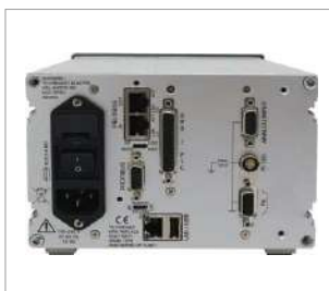
Rear view of device with connections