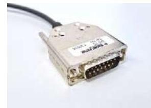
SUB-D connector for EF 5, EF 6, EF 7 EF 14

The numerical values given are the nominal values. The exact values of the winding areas, constants and resistances are determined for each coil by a calibration.