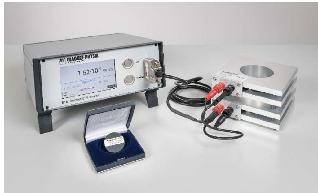
Fluxmeter EF 6, MS 75, ME 7

As a passive measuring coil connected to a fluxmeter, the Helmholtz coil enables measurements of the magnetic dipole moment according to IEC 60404-14. The measurements of the magnetic dipole moment is a fast, precise absolute part inspection for the quality control of magnets. The magnets can have any geometric shape, only a dipole magnetization is required. The magnetization state of the test specimens is not changed by the measurement. The measuring principle can be applied to all ferromagnetic materials. The coil bodies of the MS 20, MS 75, MS 150 and MS 210 coils are milled from solid aluminum and are of extremely high quality and robust. Each coil is measured in our DAkkS accredited calibration laboratory before delivery. The coil constant (sensitivity) determined in this way is documented in a DAkkS calibration certificate and also noted on the coil. The coils are available with universal laboratory plugs (bunch plugs), or with a Sub-D plug for connection to the EF 5, EF 6, EF 7 and EF 14 Magnet-Physik fluxmeters. The sensitivity of the measuring coil, determined by DAkkS calibration, is stored in the memory contained in the plug and is automatically read out when connected to the Magnet-Physik fluxmeter. Manual input of coil data into the meter is not required. Due to the robust design of the coils, the calibration values are very stable over time. An adjustable sample holder in the form of a solid arm is integrated in the MS 75, MS 150 and MS 210 coils.