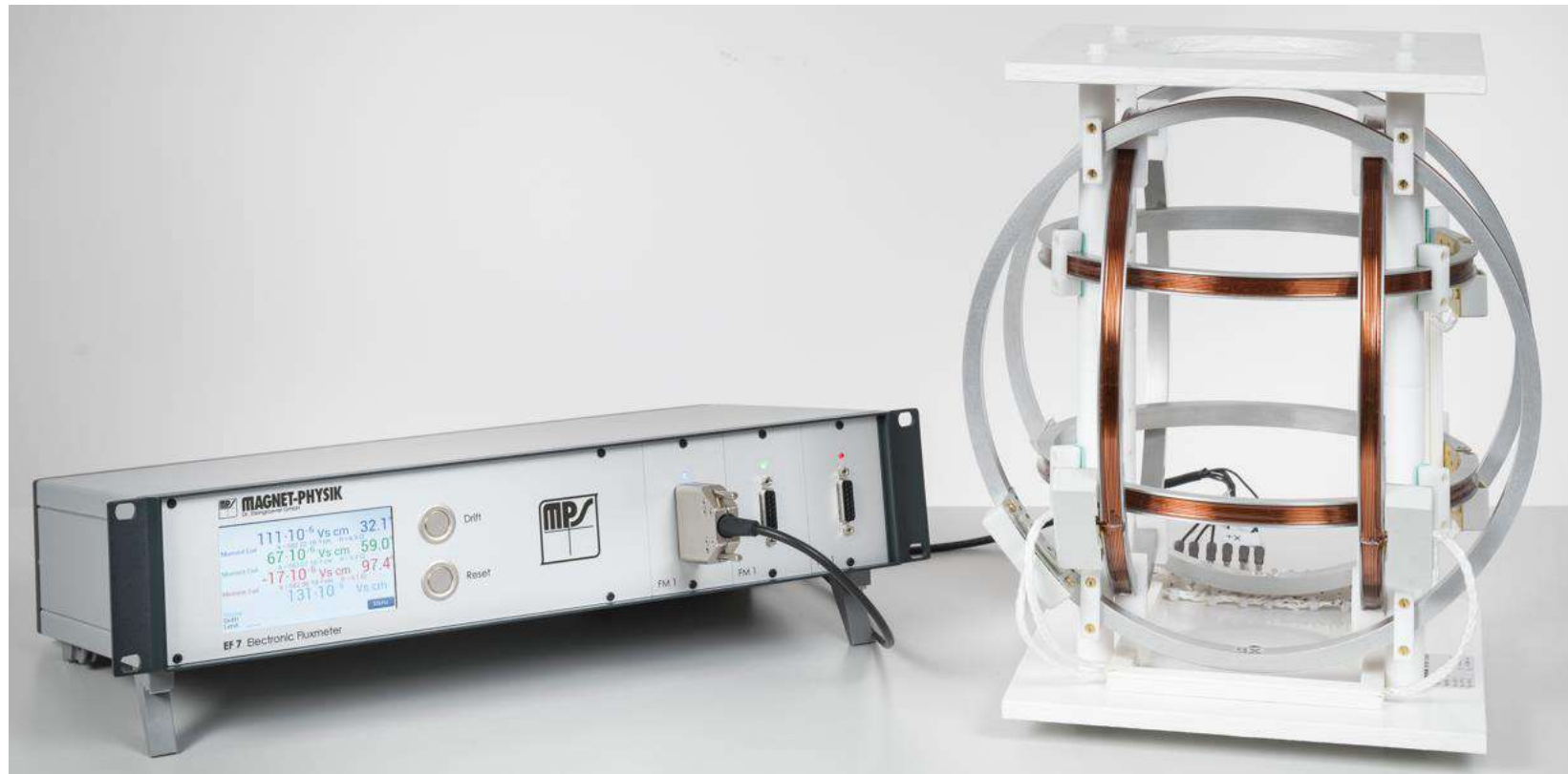
EF 7 (3-Channel version) MS 300-3

In addition to the 1-axis coils, we offer coils with up to three axes, which allow simultaneous measurement of the dipole moment in all three orthogonal spatial axes and thus the calculation of the angular error of a magnet. Use the 3-axis coils with a 3-Channel Fluxmeter EF 7. This setup can automatically calculate the vector sum of the magnetic dipole moment and the vector angle. Furthermore, with 3-axis coils it is possible to generate a defined magnetic field in any direction. This is of interest for testing and calibration of sensors, or for compensation of external magnetic fields.