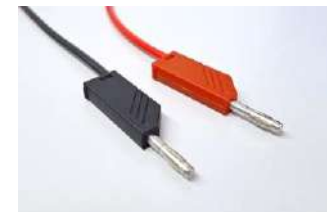
Plug with bunch contacts